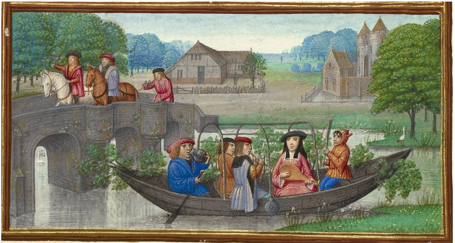
Music-making in the zodiacal sign of Gemini from Libro d'Ore Spinola (Bruges, 1510 – 1520 circa) Getty Museum

Early English Books Creation Partnership, http://name.umd.umich.edu/A16743.0001.001