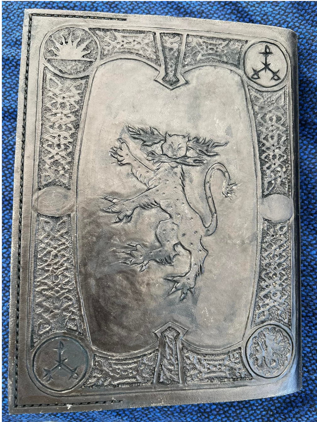
Leather bookcover with a Panther Rampant Guardant

Thanks to all the artisans who participated. As editor I had to select a limited number to include here. Unfortunately, not all pieces had their makers' names in the caption. If any of these is yours, please let me know so I can credit you.