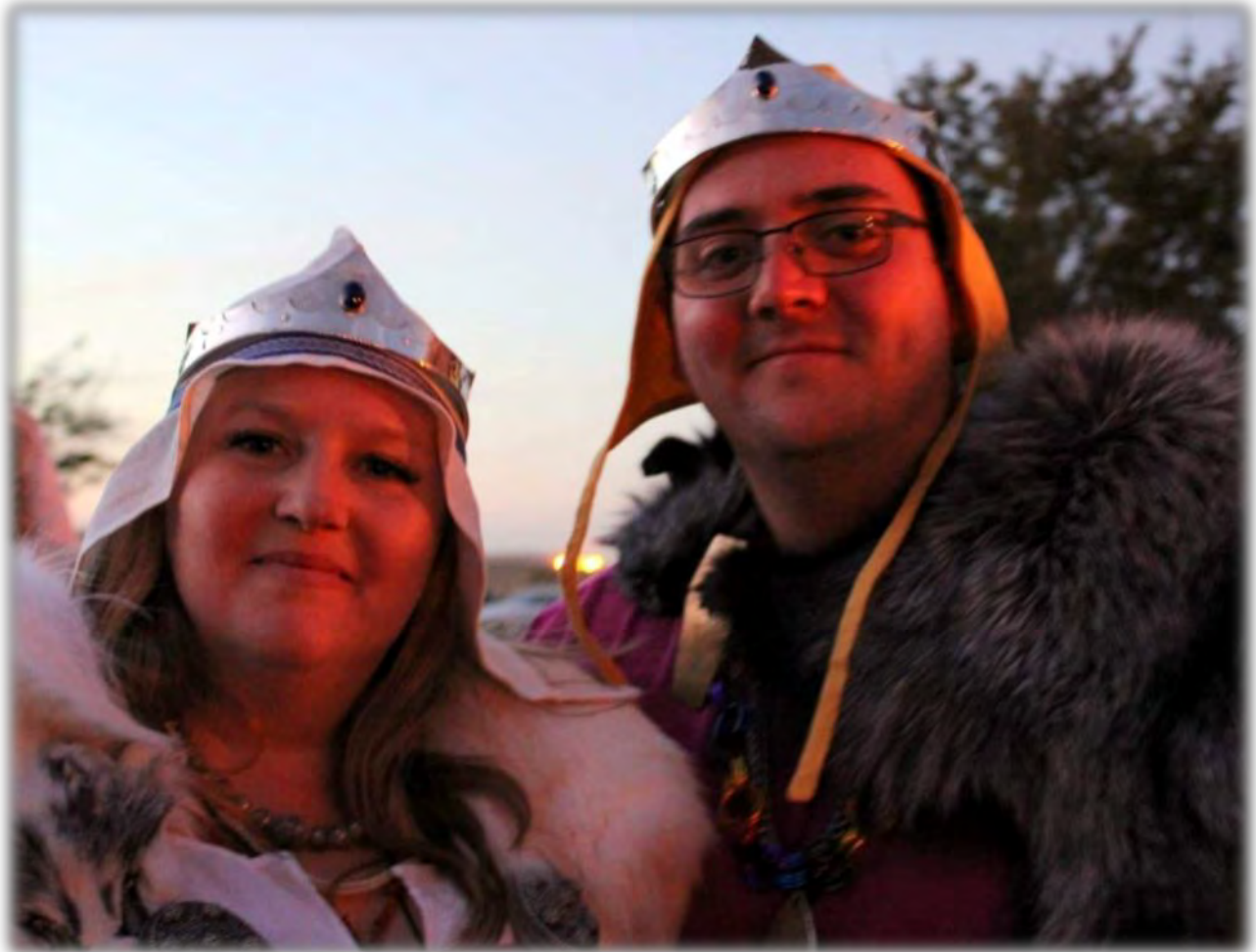
Their Highnesses at Great Western War.